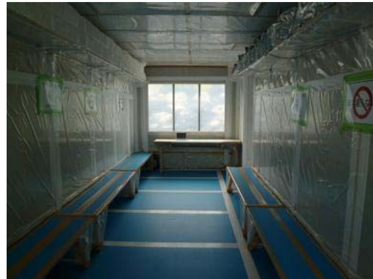
Photo : Around 12:30 pm on July 1, 2011 Place : Inside the rest area