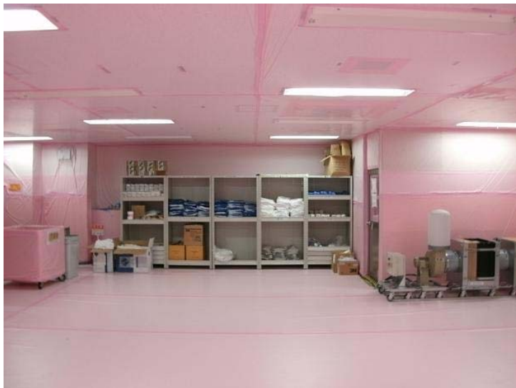
Photo : Around 11:30 am on July 21, 2011 Place : Storage rack at the rest area