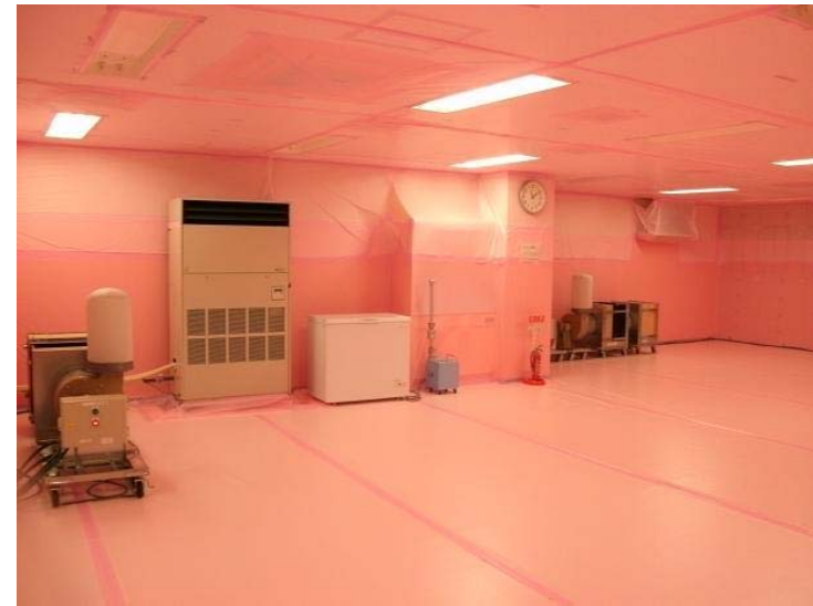
Photo : Around 11:30 am on July 21, 2011 Place : Inside the rest area. Local exhausters, air conditioner, refrigerator, dust sampler, digestive apparatus, local exhausters (from left)