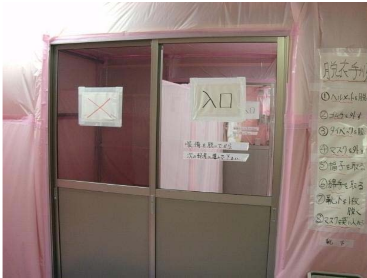
Photo : Around 11:30 am on July 21, 2011 Place : Entrance of rest area