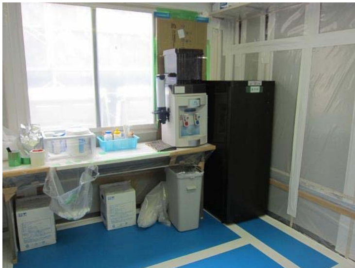
Photo : Around 1:30 pm on July 22, 2011 Place : Facilities inside the rest area (Drinkable water, refrigerator)