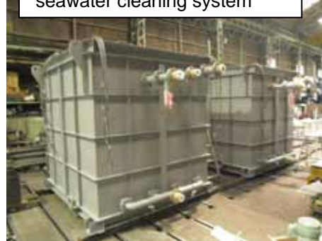
Installation of circulating seawater cleaning system