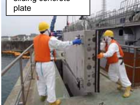
Installation of sliding concrete plate