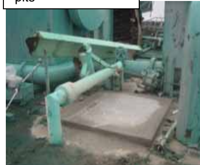
Blockage work at pits