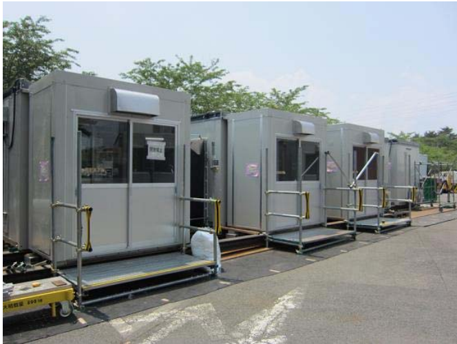
Photo: Around 12:00 am on June 10, 2011 Place: Appearance of the rest area