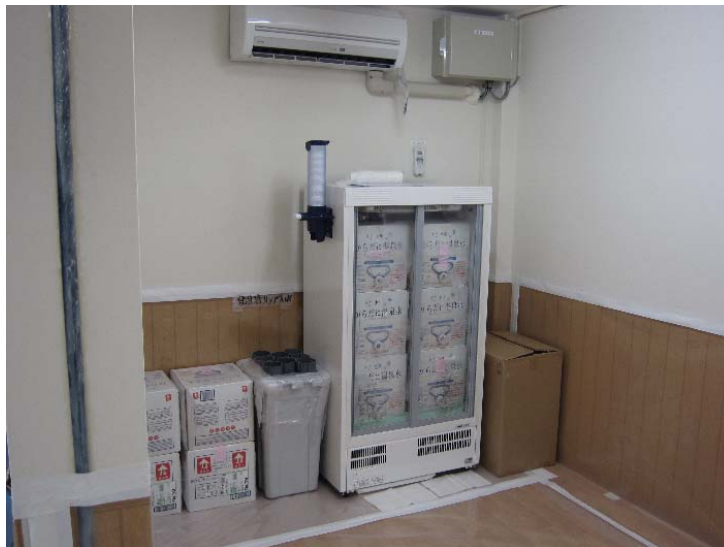
Photo: Around 11:00 am on July 2, 2011 Place: Drinkable water machine inside the rest area