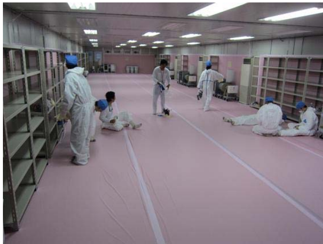
Photo: Around 12:30 am on June 13, 2011 Place: Inside the rest area