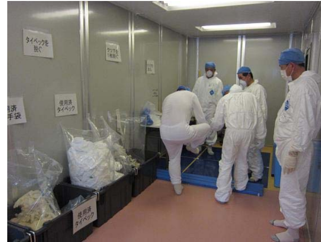
Photo: Around 12:00 am on June 10, 2011 Place: During wearing/removing gears