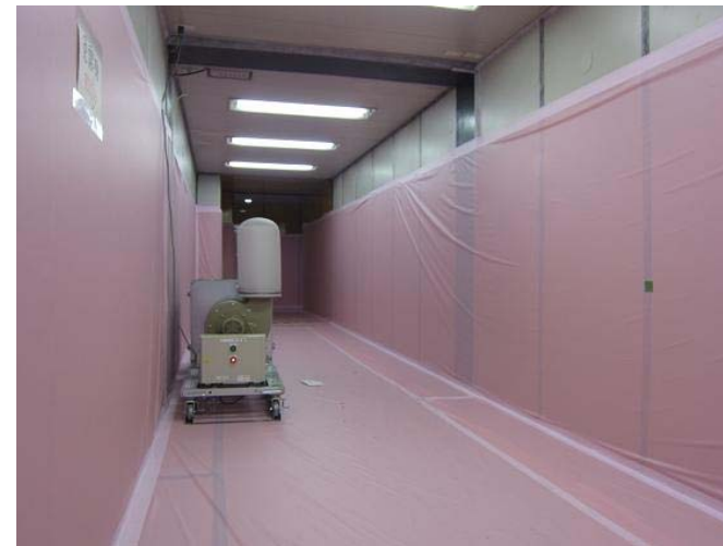
Photo: Around 12:30 am on June 13, 2011 Place: Hallway and a local exhauster