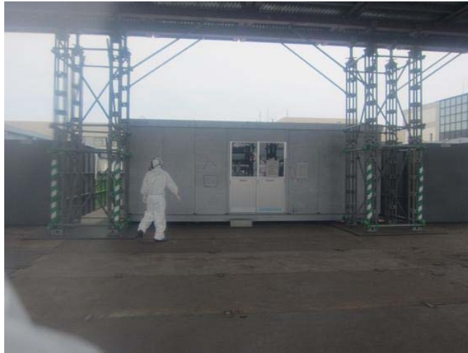
Photo : Around 11:00 am on June 12, 2011 Place : Appearance of the rest area