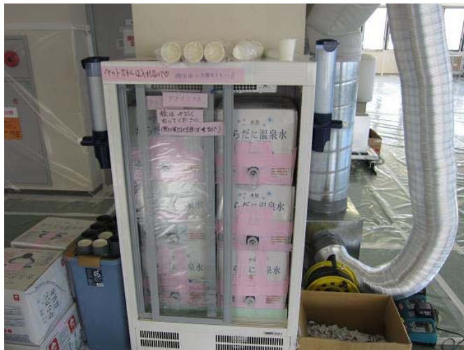
Photo: Around 3:00 pm on June 30, 2011 Place: Drinkable water machine