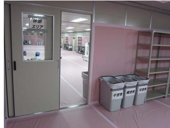
Photo: Around 12:30 am on June 13, 2011 Place: Entrance door at the rest area