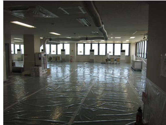
Photo: Around 3:00 pm on June 30, 2011 Place: Inside the rest area