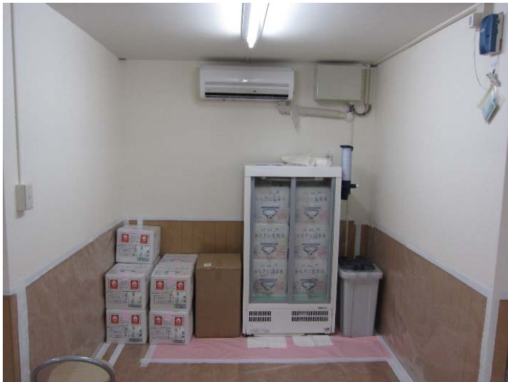
Photo: Around 11:00 am on July 2, 2011 Place: Drinkable water machine in front of the rest area