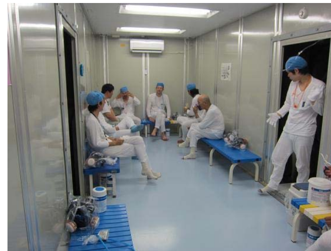
Photo: Around 12:00 am on June 10, 2011 Place: Inside the rest area