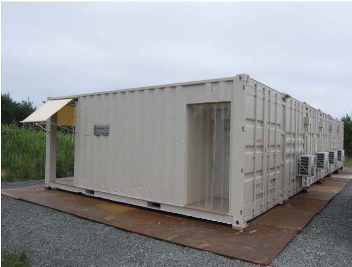
Photo: Around 11:00 am on July 2, 2011 Place: Appearance of the rest area