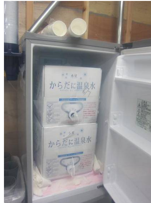
Photo: Around 11:00 am on June 12, 2011 Place: Drinkable water machine in front of the rest area