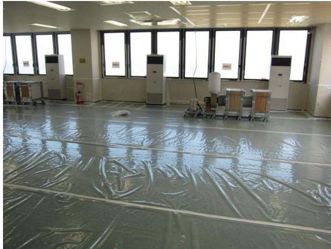
Photo: Around 3:00 pm on June 30, 2011 Place: Inside the rest area