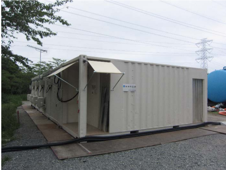
Photo: Around 11:00 am on July 2, 2011 Place: Appearance of the rest area