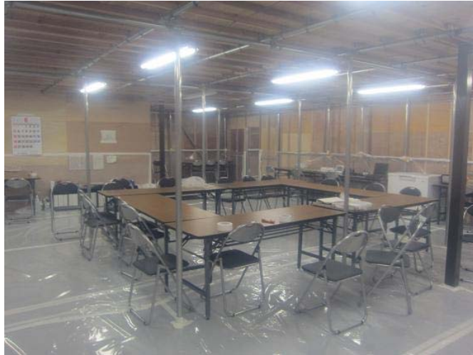
Photo: Around 11:30 am on June 12, 2011 Place: Inside the rest area