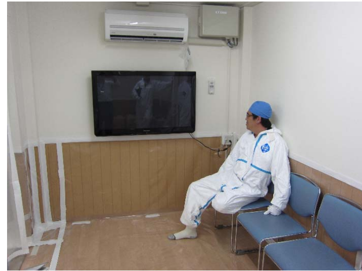
Photo: Around 11:00 am on July 2, 2011 Place: Inside the rest area