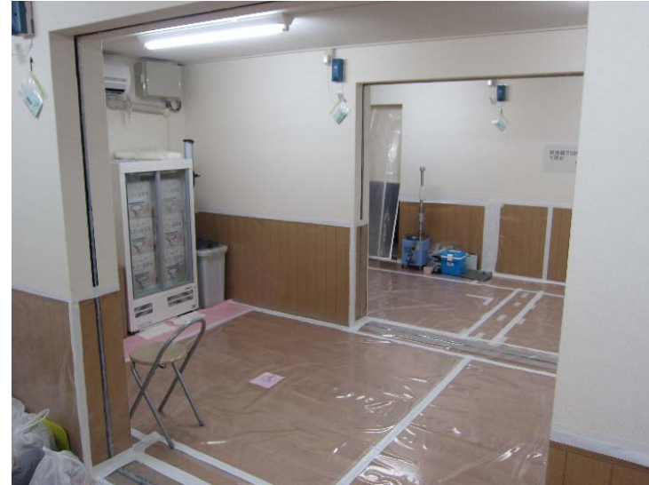
Photo: Around 11:00 am on July 2, 2011 Place: Inside the rest area