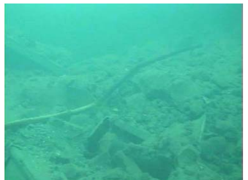
Pict④ : Deposited Material over Fuel Storage Rack