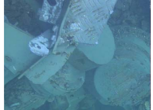
Pict① : Electric Motor of Fuel Exchanger