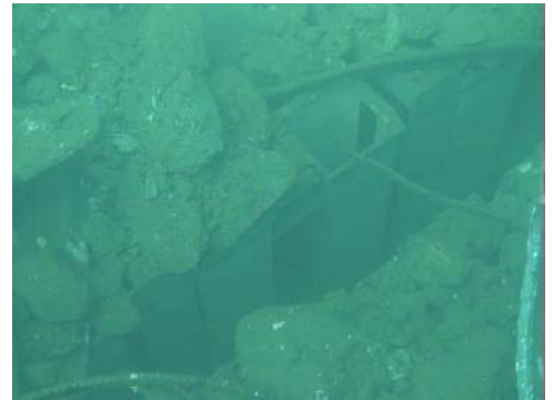
Pict③ : Fuel Storage Rack