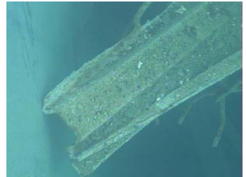
Pict② : Deck Plate