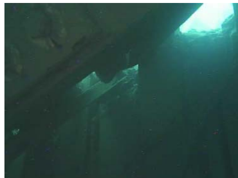
Pict⑤ : Endtrack of Fuel Exchanger

※Photos ①② and ③④⑤ are captured images of the underwater camera video recorded on Oct. 11 and Oct. 12 respectively.