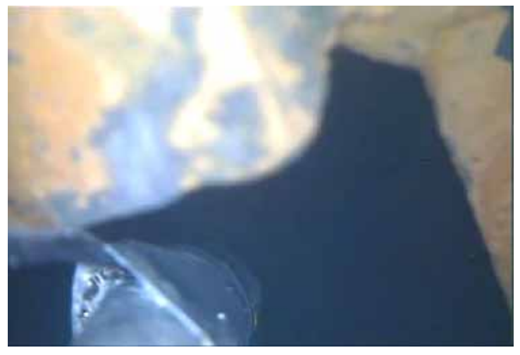
3. Accumulated water (Under water) Photos taken on October 10, 2012 by TEPCO