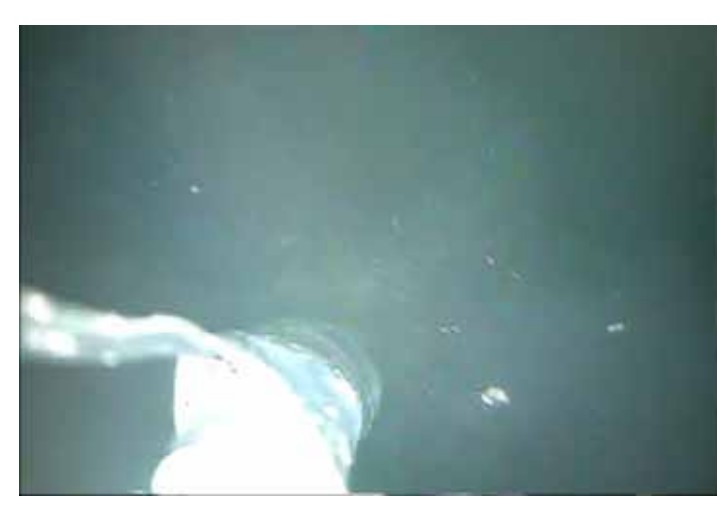
2. Accumulated water (Water surface)