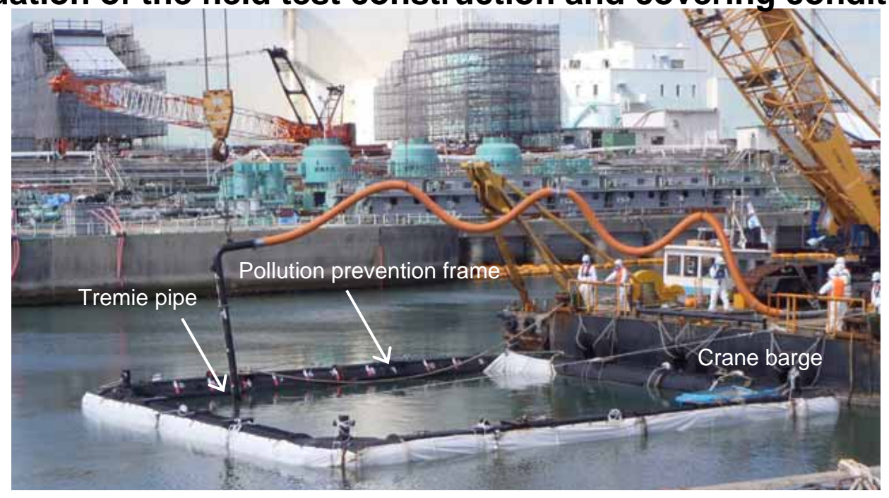
Situation of the field test construction in front of the intake channel of Unit 1-4 February 28, 2012

Ocean soil covering work in front of the intake channel of Karch 13, 2012 Fukushima Daiichi Nuclear Power Station Tokyo Electric Power Company Situation of the field test construction and covering condition