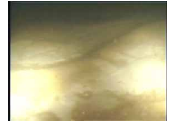
Seafloor condition after 2nd layer covering March 10, 2012