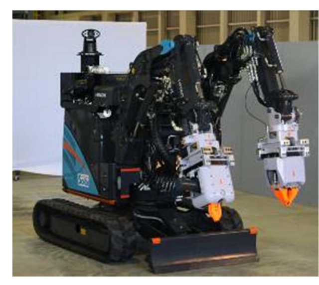
Remote-controlled heavy equipment (ASTACO-SoRa)