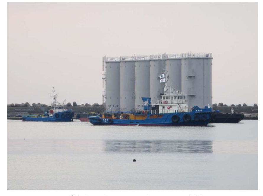
Shipping on barge (2)