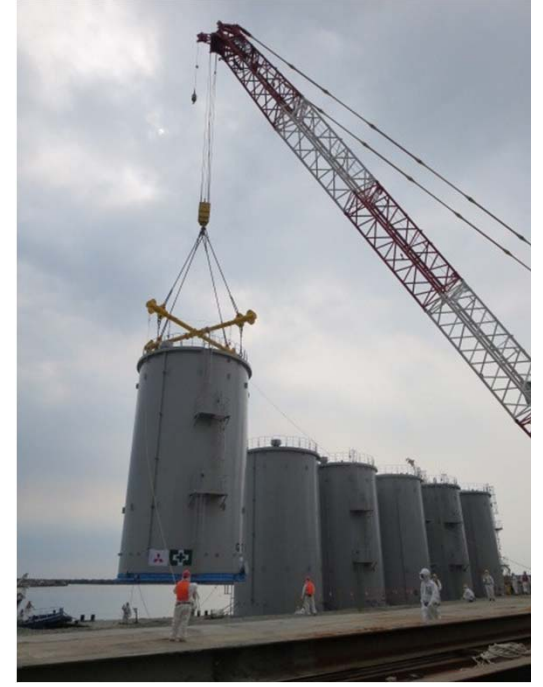
Drained at shallow draft quay Boarded on super carrier (1)