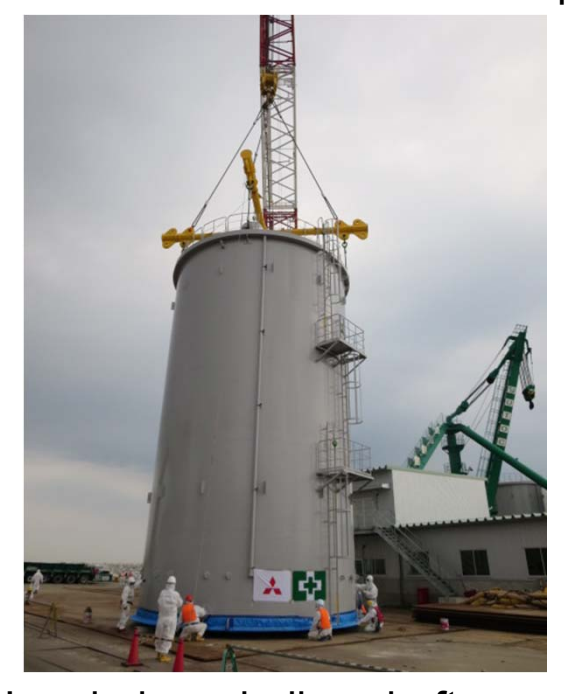
Loaded on shallow draft quay