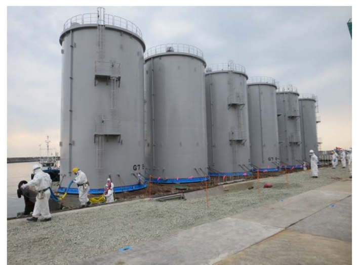
Docked at shallow draft quay