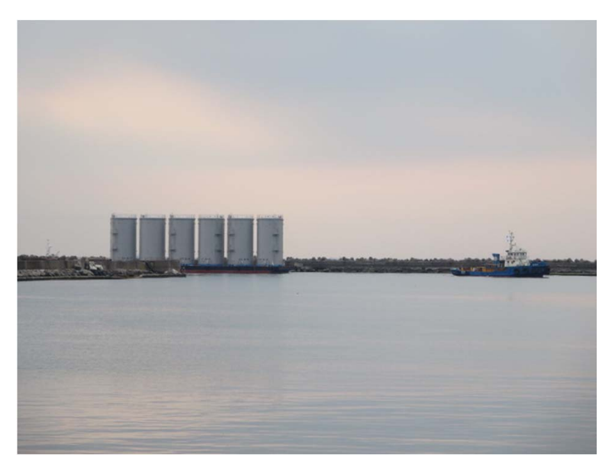
Shipping on barge (1)

9:20: First tank lifted up to the shallow draft quay