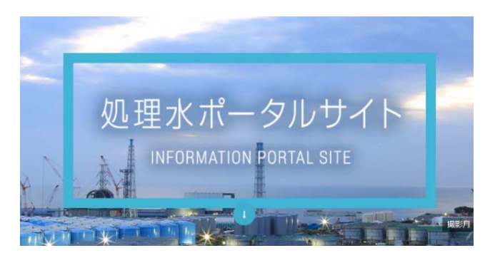
Treated Water Portal Site

We will communicate the discharge method, inspection system, measurements and monitoring results accurately in a timely and easy-to-understand manner. We will also continuously improve our communication based on feedback.