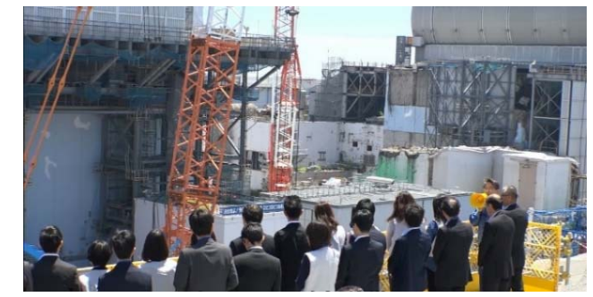
A station visit