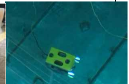
Submersible ROV running underwater