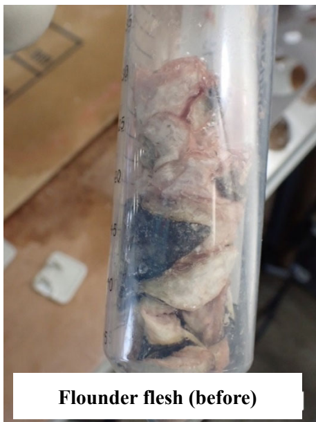
Flounder flesh (before)