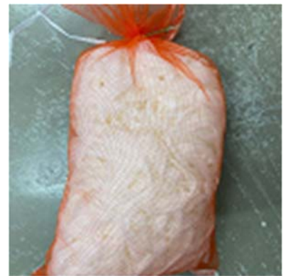
Feed to Bacteria