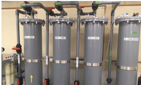
Replacing the filtering media of filter at the top of the stream

The growth of bacteria is slow, they decompose ammonia in excrement of marine organism. If this goes on, it might impose a negative effect on marine lives, therefore, we replaced the filtering media at the top of stream with the other media with favorable bacteria clinging to it which used until July. The concentration is slightly decreasing. Follow-up is required.