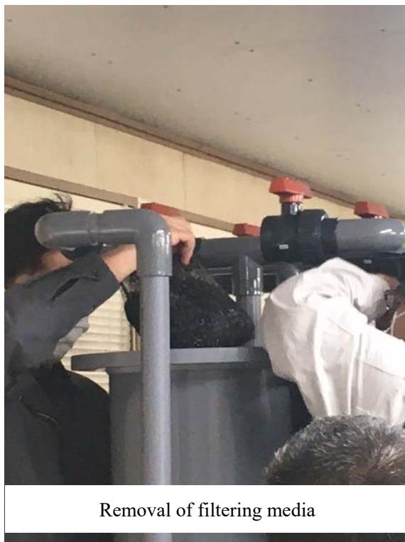
Removal of filtering media