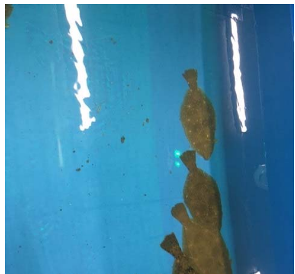
Tank on Aug., 3 A little residues on the bottom